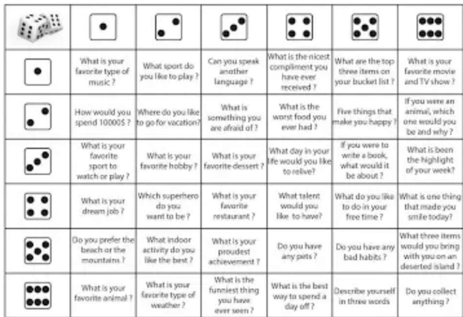
TABLE TALK DICE - GETTING TO KNOW YOU