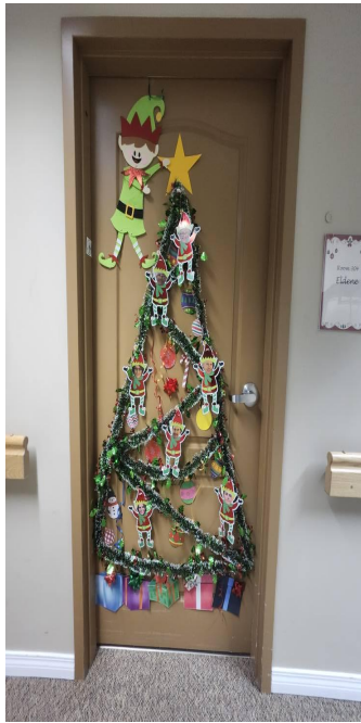
“Most Christmassy” Decorated by her family