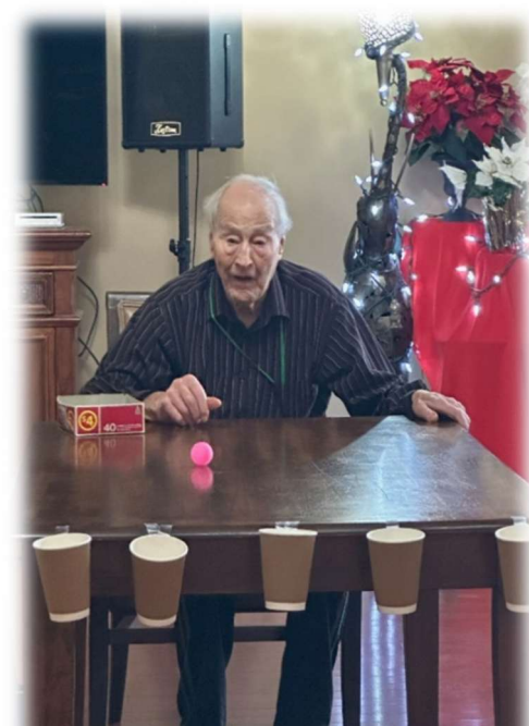
RESIDENT & STAFF CHRISTMAS PARTY