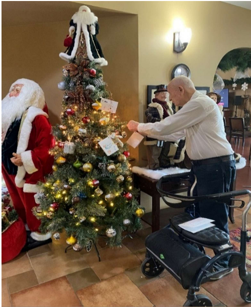
Christmas Card and Christmas Hat Making