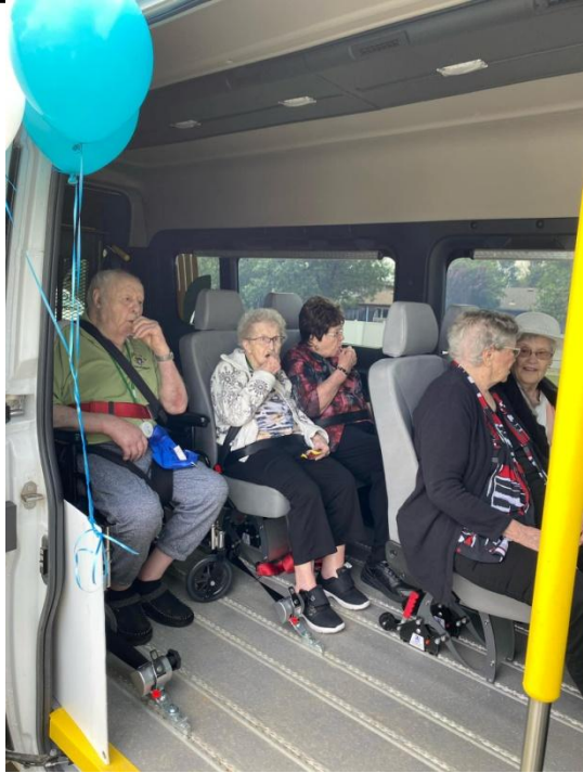
& What a wonderful parade it was....