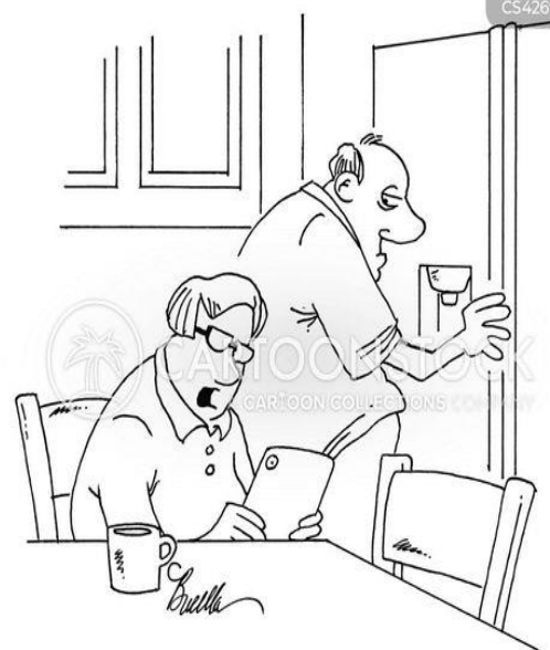
"What's creaking...you or the floor?"