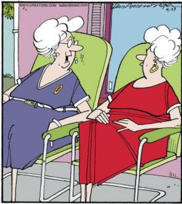
"I replace forgotten memories with stuff I make up."