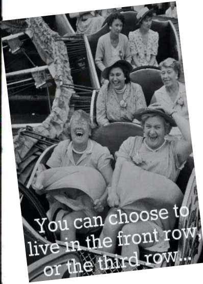
You can choose to live in the front row, or the third row...