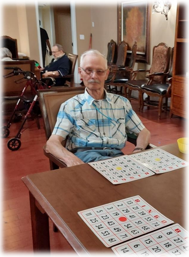
..afternoon filled with laughter, fun, friendship and memories....