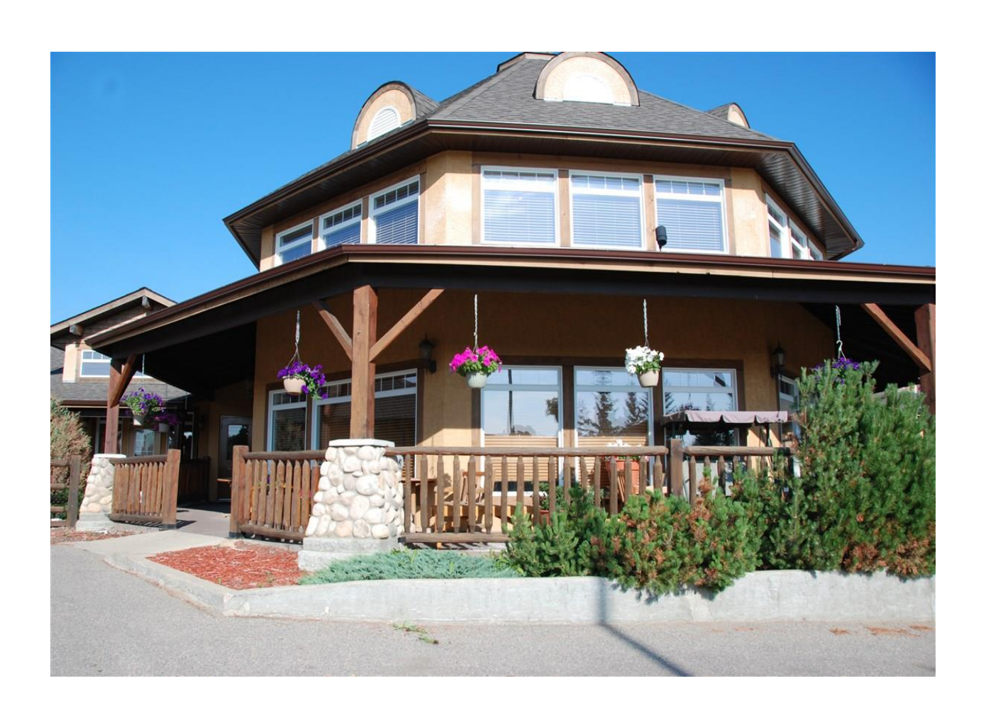
The Care Home with a Heart