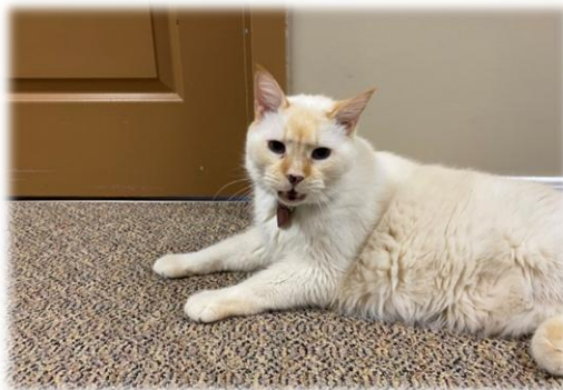
Zach – One of Bettie's cats